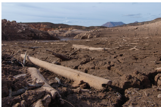
A dry lake bed in Gunlock State Park, Utah.

Drought, as expressed in Colorado River flow, is projected to become more frequent, more intense, and longer-lasting, resulting in water deficits not seen during the historic record. Projected intensified Colorado River drought conditions are not due to changes in precipitation, but to warming, which leads to reduced snowpack and soil moisture and increased evapotranspiration.